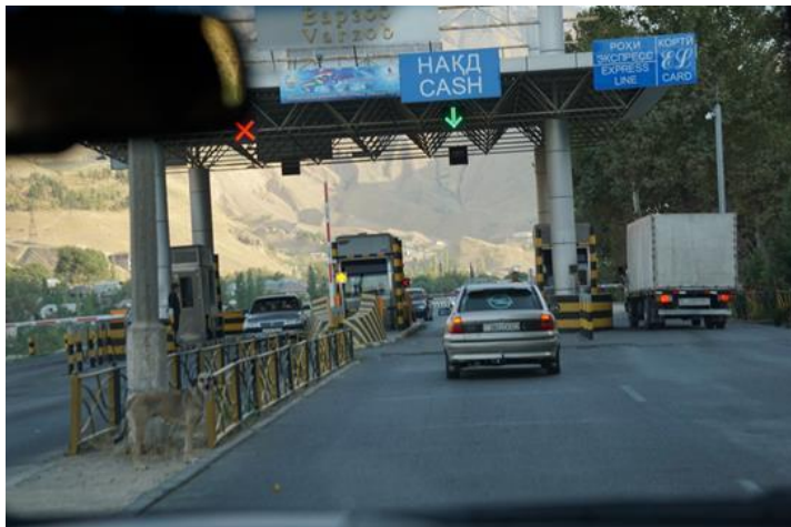
A toll gate located nearby Dushanbe