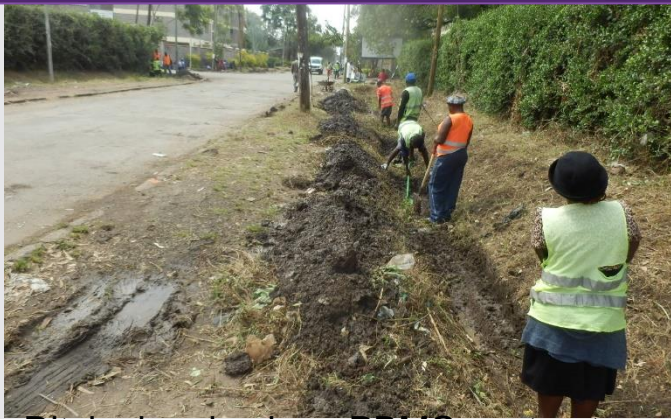
Ditch cleaning by a PBMC contractor in Kenya

WB is likely to provide loans to fund PBMC with higher responsibility of contractors.