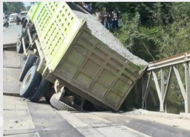
An over loaded truck severely damaged a bridge in Cambodia.