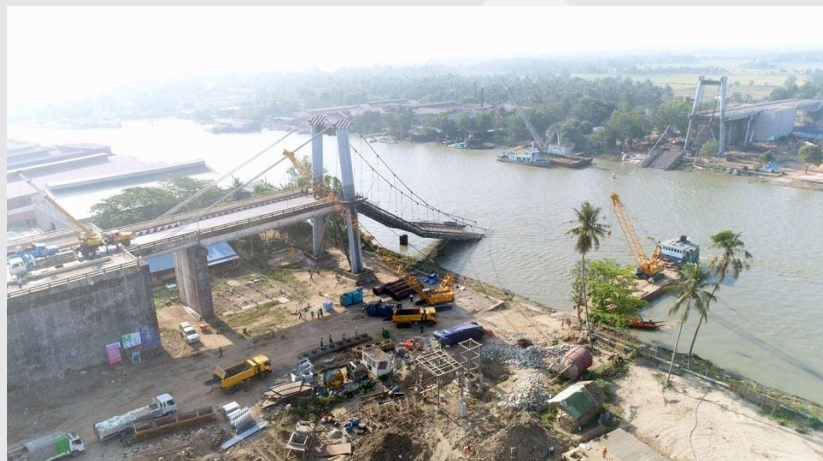
Myaungmya Bridge in Myanmar collapsed in 2018 because of corrosion of suspension cable.