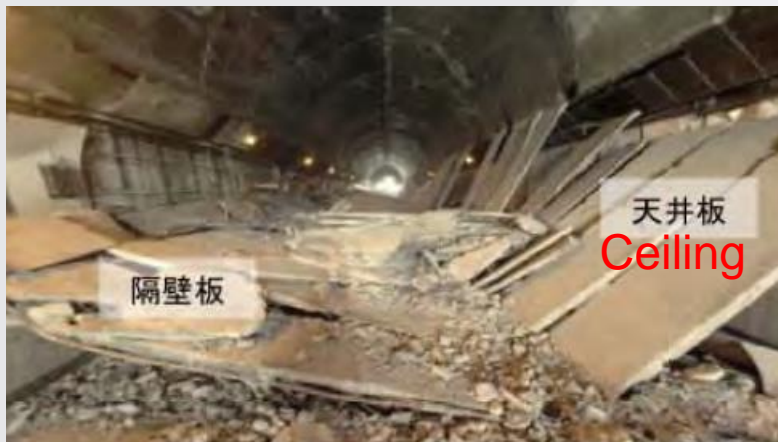
Sasago Tunnel Ceiling Collapse killed 9 persons in Japan in 2012