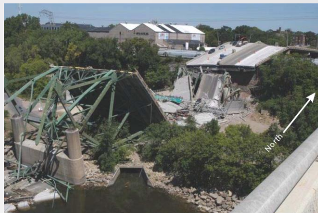
Collapse of I-35W Mississippi River Bridge in USA in 2007 killed 13 and injured 145 people.