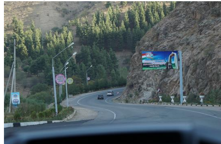
Well maintained toll road section